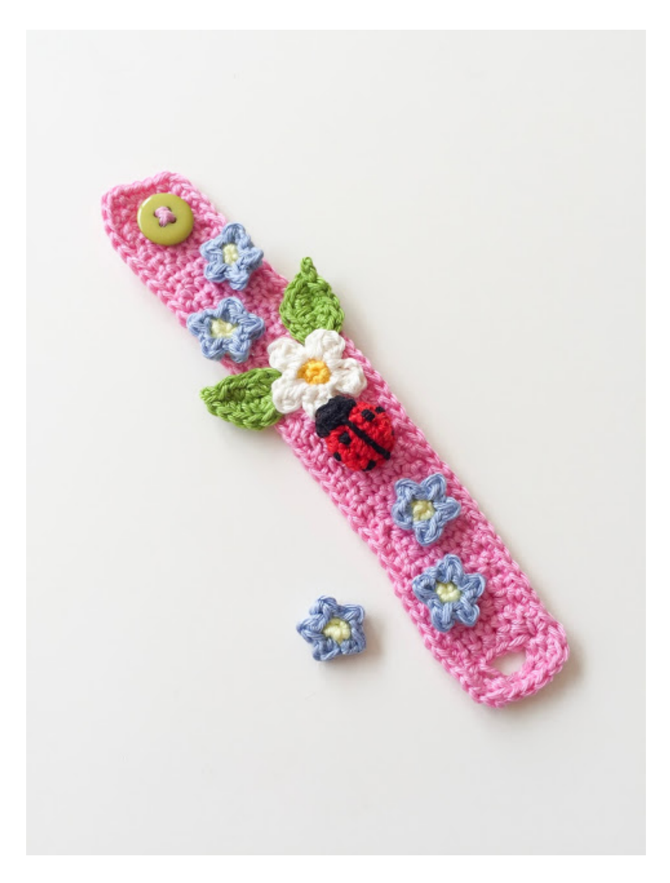
You can also add a few little flowers like these (forgetme-not-flowers)