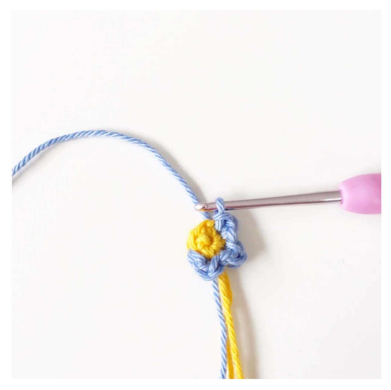
R2.: (1 slst, 1 dc, 1 slst) x 5.